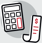
Accounting & Reports