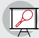
Programs & Memberships