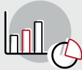
Real-Time Data & Statistics