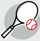
Court & Activity Booking