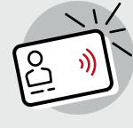
Access control & Automations